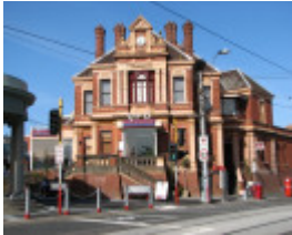
FORMER KEW POST OFFICE SOHE 2008