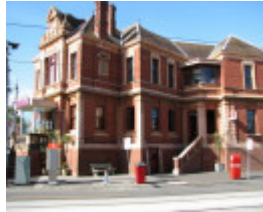
FORMER KEW POST OFFICE SOHE 2008