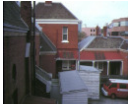
former kew post office rear view