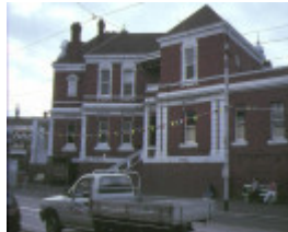
former kew post office cotham road view