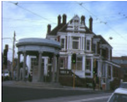
1 former kew post office front view