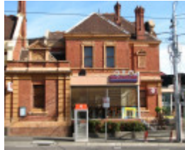
FORMER KEW POST OFFICE SOHE 2008