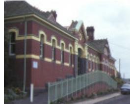
1 korumburra railway station compelx station street korumburra entrance may1984