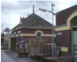
korumburra railway station complex station street korumburra station buildings may1984