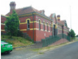
KORUMBURRA RAILWAY STATION COMPLEX SOHE 2008