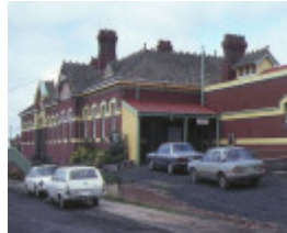
korumburra railway station complex station street korumburra front view may1984