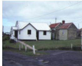
korumburra railway station complex station street korumburra outbuildings may1984