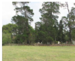
WUCHATSCH'S FARM SOHE 2008