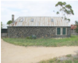
WUCHATSCH'S FARM SOHE 2008