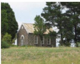
WUCHATSCH'S FARM SOHE 2008