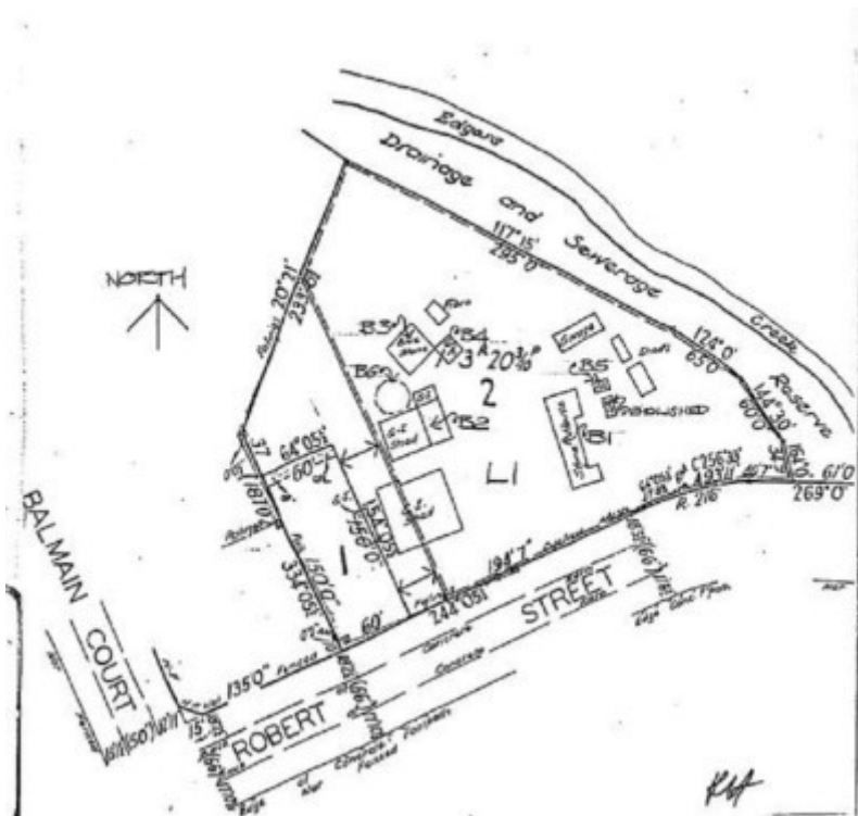
h00950 plan h0950