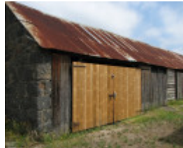
WUCHATSCH'S FARM SOHE 2008