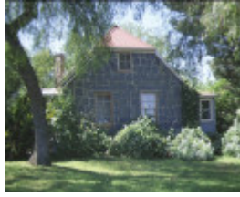
1 wutchach farm robert street thomastown front view