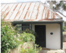
WUCHATSCH'S FARM SOHE 2008