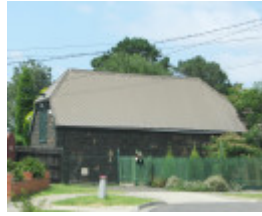
WUCHATSCH'S FARM SOHE 2008