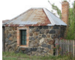
WUCHATSCH'S FARM SOHE 2008