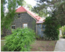
WUCHATSCH'S FARM SOHE 2008