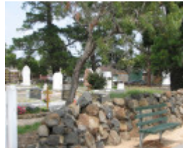
WUCHATSCH'S FARM SOHE 2008