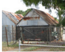
WUCHATSCH'S FARM SOHE 2008