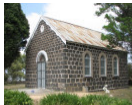
WUCHATSCH'S FARM SOHE 2008