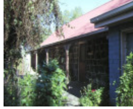
wutchach farm robert street thomastown verandah