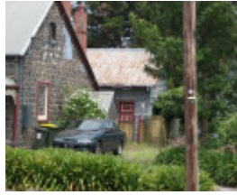
WUCHATSCH'S FARM SOHE 2008