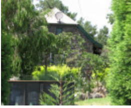
WUCHATSCH'S FARM SOHE 2008