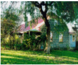
wutchach farm robert street thomastown side view publication