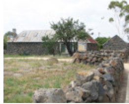
WUCHATSCH'S FARM SOHE 2008