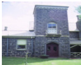
elcho homestead elcho road lara tower view