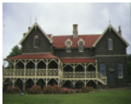
1 elcho homestead lara front view