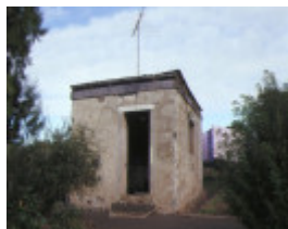
elcho homestead elcho road lara outbuilding