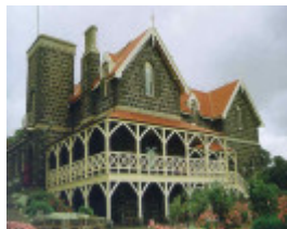
elcho homestead elcho road lara corner view publication