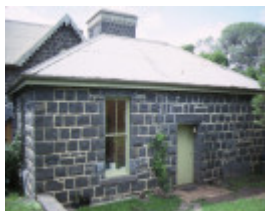
elcho homestead elcho road lara rear view bluestone