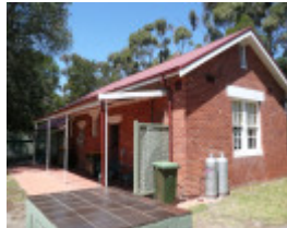
PIRRA HOMESTEAD SOHE 2008