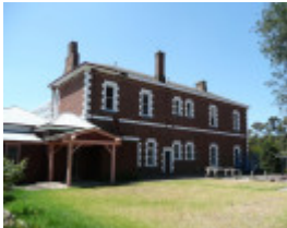
PIRRA HOMESTEAD SOHE 2008