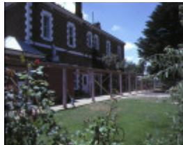
pirra homestead windermere road lara rear walkway & pergolas jan1985