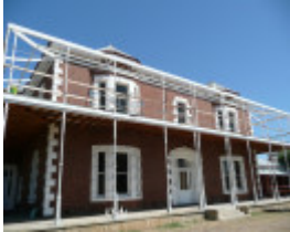
PIRRA HOMESTEAD SOHE 2008