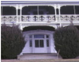
pirra homestead windermere road lara entrance sep1982