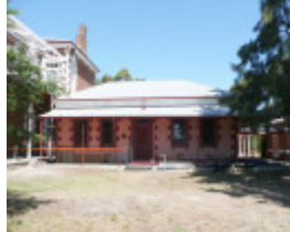
PIRRA HOMESTEAD SOHE 2008