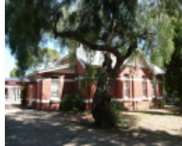
PIRRA HOMESTEAD SOHE 2008