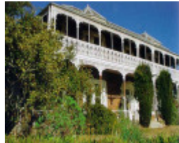
pirra homestead windermere road lara front view publication