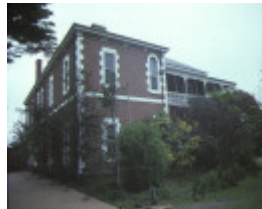
pirra homestead windermere road lara side view sep1984