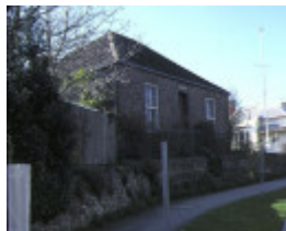
1 montrose cottage ballarat front view