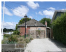
MONTROSE COTTAGE SOHE 2008