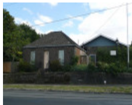
MONTROSE COTTAGE SOHE 2008