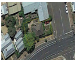
Montrose Cottage aerial diagram