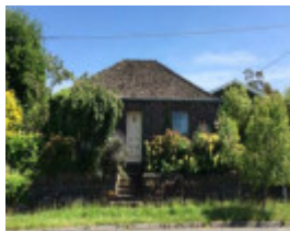
Montrose Cottage 2020