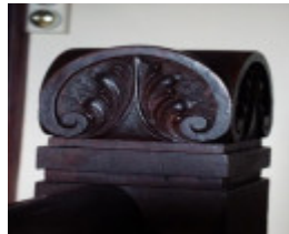
B1403 Ballam Park