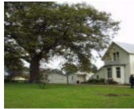
B1403 Ballam Park