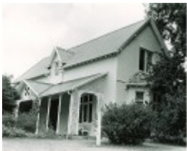
B1403 Ballam Park