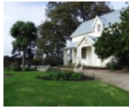
B1403 Ballam Park