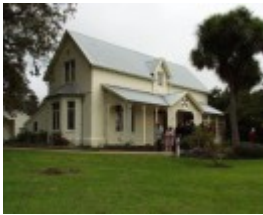
B1403 Ballam Park