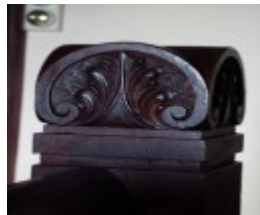
B1403 Ballam Park