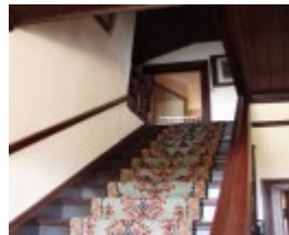
B1403 Ballam Park