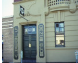
provincial hotel ballarat entrance