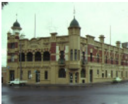
1 provincial hotel ballarat front view sep1990