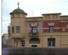
provincial hotel ballarat view tower sep1989