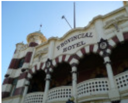
THE PROVINCIAL HOTEL SOHE 2008