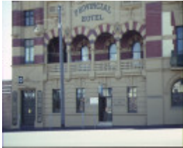
provincial hotel ballarat detail balcony feb1990