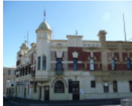
THE PROVINCIAL HOTEL SOHE 2008