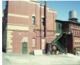
provincial hotel ballarat rear view feb1990