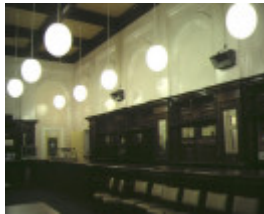
ballarat railway complex interior of station building