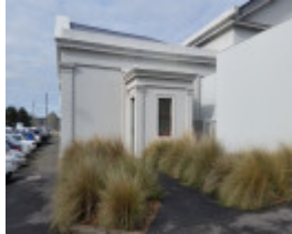
Reconstructed entry porch, north side station building refer P20705