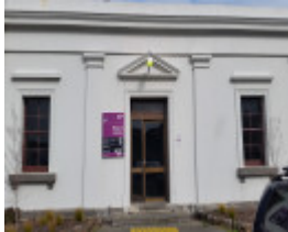
Modern and highly intrusive entry door to the north side station building