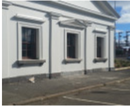
Reconstructed bay to the west end of the north side of station building refer P20705