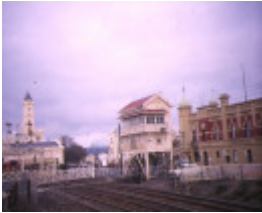
ballarat railway complex site view