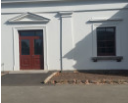
Reconstructed pedimented entry to north side station building refer P20705