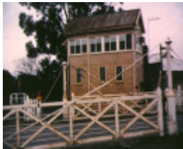
ballarat railway complex signal box & gates