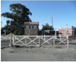
BALLARAT RAILWAY COMPLEX SOHE 2008