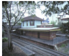
malvern railway station complex station street malvern end view sep1984