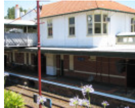
MALVERN RAILWAY STATION SOHE 2008