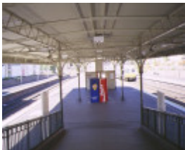
malvern railway station complex station street malvern central platform entrance apr1997