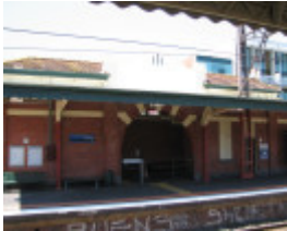
MALVERN RAILWAY STATION SOHE 2008