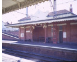
1 malvern railway station complex station street malvern south elevation apr1997