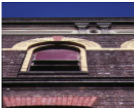
former denton hat mills nicholson street abbotsford detail of window