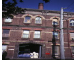
former denton hat mills nicholson street abbotsford delivery entrance