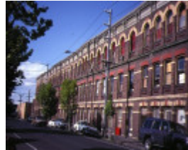
1 former denton hat mills nicholson street abbotsford front view