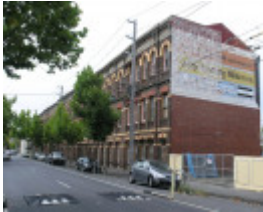
FORMER DENTON HAT MILLS SOHE 2008