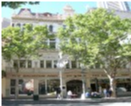
SALVATION ARMY TEMPLE SOHE 2008