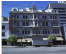
1 former salvation army temple bourke street melbourne front view jan1979