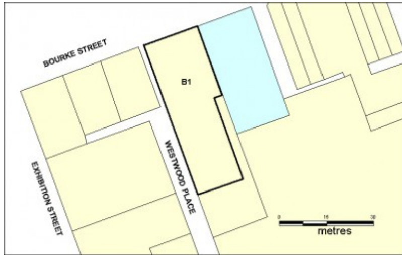
Salvation Army Temple Bourke Street Extent Of Registration Plan March 2000