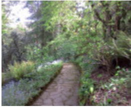
G13100 Alton Gardens