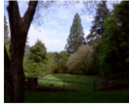
G13100 Alton Gardens