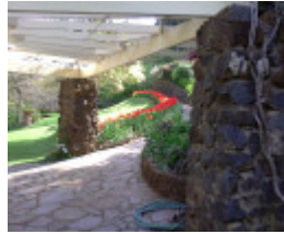
G13100 Alton Gardens