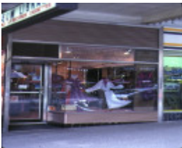
the athenaeum building collins street melbourne shop front oct1982