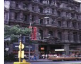
block arcade melb external view