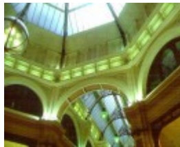
block arcade melb arcade detail sw oct99