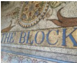
BLOCK ARCADE July 2016