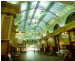
1 block arcade melb arcade view sw oct99