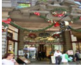
BLOCK ARCADE SOHE 2008