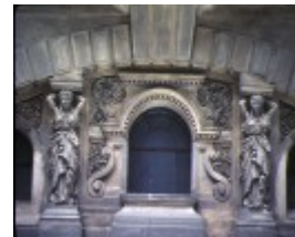
block arcade melb detail exterior