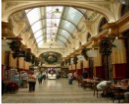
BLOCK ARCADE SOHE 2008