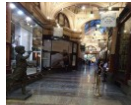
BLOCK ARCADE July 2016