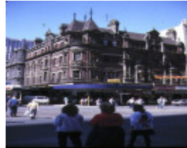
1 melbourne city building elizabeth street melbourne corner view feb1986