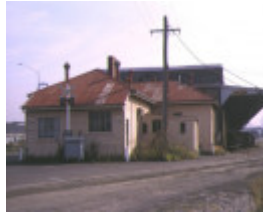
exhibition goods shed spencer street melbourne amenity room number 6 shed mar1989