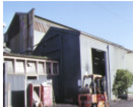
exhibition goods shed spencer street melbourne side view of flinders street extension goods shed