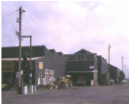
exhibition goods shed spencer street melbourne remnants of number 1 shed