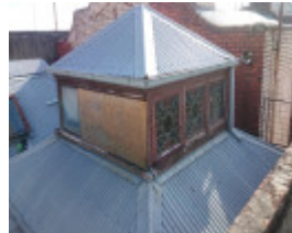
Before Photographs - Reference F3907 2014