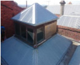
Before Photographs - Reference F3907 2014