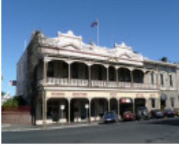
FORMER REIDS COFFEE PALACE SOHE 2008