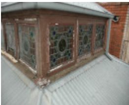
Before Photograph - Reference F3907 2014