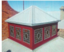
After Photograph - Reference F3907 2016