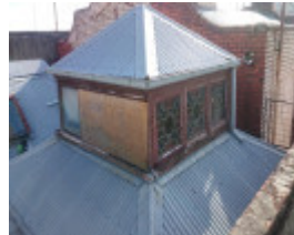
Before Photographs - Reference F3907 2014