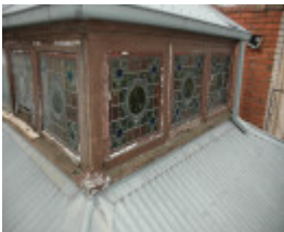
Before Photograph - Reference F3907 2014