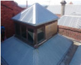
Before Photographs - Reference F3907 2014