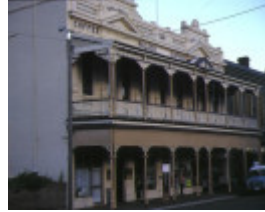
1 reids coffee palace ballarat front view yellow facade