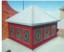
After Photograph - Reference F3907 2016