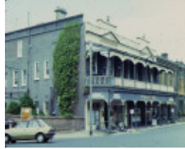
reids coffee palace ballarat side view feb1985