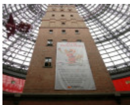
COOPS SHOT TOWER AND FLANKING BUILDING SOHE 2008