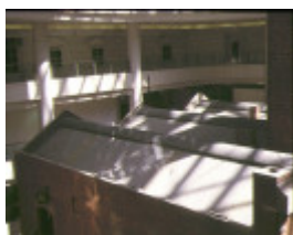
coops shot tower & flanking building knox place melb roof detail