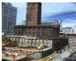
1 coops shot tower & flanking building knox place melb external view construction of melb central