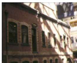
coops shot tower & flanking building knox place melb front view