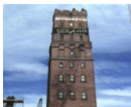
coops shot tower & flanking building knox place melbourne tower detail prior to erection of melbourne central