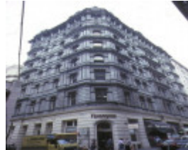
stalbridge chambers little collins street melbourne front elevation may1989