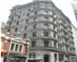
STALBRIDGE CHAMBERS SOHE 2008