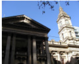
h00001 melbourne town hall and administration bldg swanston street melbourne clock she project 2004