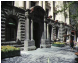
melbourne town hall swanston street melbourne ext bluestone