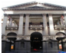
H0001 melbourne town hall and administration bldg swanston street melbourne main entrance she project 2004