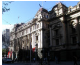
H0001 melbourne town hall and administration bldg swanston street melbourne front she project 2004