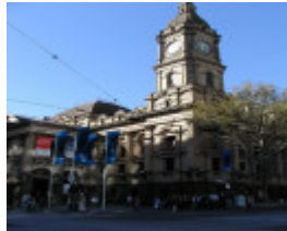
h00001 melbourne town hall and administration bldg swanston street melbourne clock corner she project 2004