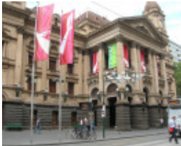
MELBOURNE TOWN HALL AND ADMINISTRATION BUILDING SOHE 2008