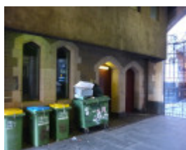
Before Photographs - Reference F3931 2014