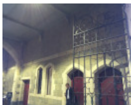
After Photographs - Reference F3931 2016