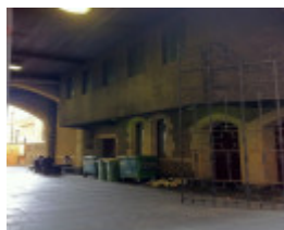
Before Photographs - Reference F3931 2014