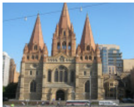
ST PAULS CATHEDRAL PRECINCT SOHE 2008