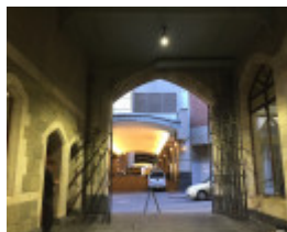
After Photographs - Reference F3931 2016