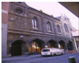
st pauls cathedral melb external chapter house