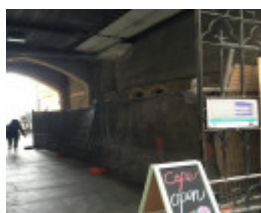
During Photographs - Reference F3931 2015