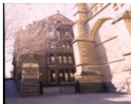
st pauls cathedral melb external offices