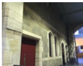
After Photographs - Reference F3931 2016