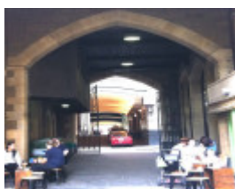
Before Photographs - Reference F3931 2014