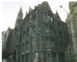
st pauls cathedral melb chapter hall