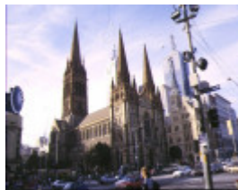
1 st pauls cathedral melb external view