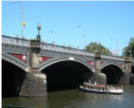
PRINCES BRIDGE SOHE 2008