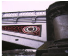
princes bridge over yarra river melbourne side detail