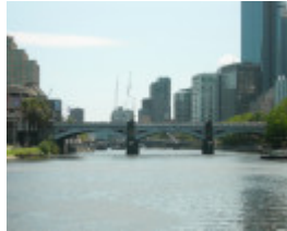
PRINCES BRIDGE SOHE 2008