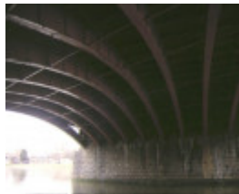
princes bridge over yarra river melbourne underside sep1998