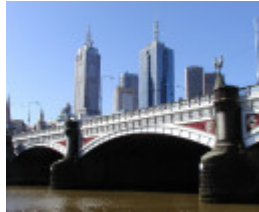
h01447 princes bridge st kilda road over yarra river melbourne long view she project 2004