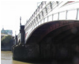
h01447 princes bridge st kilda road over yarra river melbourne below she project 2004