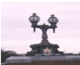
princes bridge over yarra river melbourne lamp detail sep1998