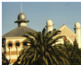
methodist church cnr deakin avenue & tenth street mildura view of roof line jun1980