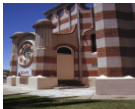
methodist church cnr deakin avenue & tenth street mildura rear entrance nov1989