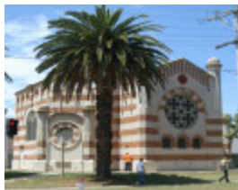
METHODIST CHURCH SOHE 2008