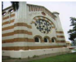
methodist church cnr deakin avenue & tenth street mildura exterior window sep1992