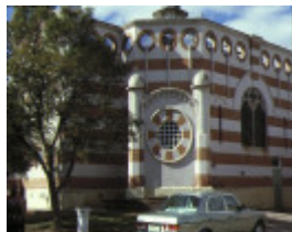
1 methodist church cnr deakin avenue & tenth street mildura side view