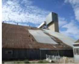
MARMALAKE/MURTOA GRAIN STORE SOHE 2008