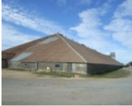
MARMALAKE/MURTOA GRAIN STORE SOHE 2008