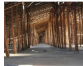
Murtoa Grain Store interior Nov 08 01