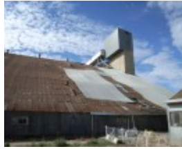
MARMALAKE/MURTOA GRAIN STORE SOHE 2008