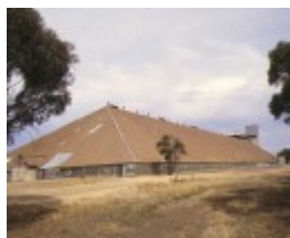
murtoa grain store wimmera hwy murtoa site view