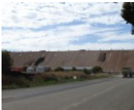
MARMALAKE/MURTOA GRAIN STORE SOHE 2008