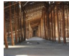
Murtoa Grain Store interior Nov 08 01