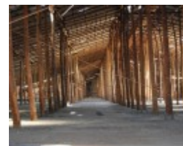
Murtoa Grain Store interior Nov 08 01