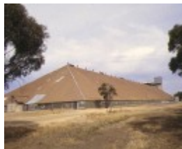
murtoa grain store wimmera hwy murtoa site view