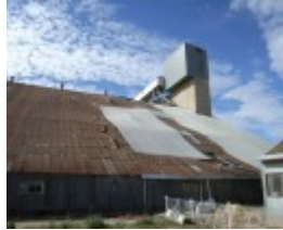
MARMALAKE/MURTOA GRAIN STORE SOHE 2008