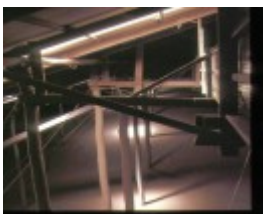
murtoa grain store wimmera hwy murtoa interior rafters