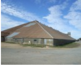
MARMALAKE/MURTOA GRAIN STORE SOHE 2008