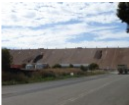
MARMALAKE/MURTOA GRAIN STORE SOHE 2008