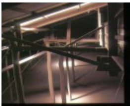
murtoa grain store wimmera hwy murtoa interior rafters