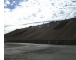
MARMALAKE/MURTOA GRAIN STORE SOHE 2008