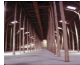
murtoa grain store wimmera hwy murtoa interior from ground view