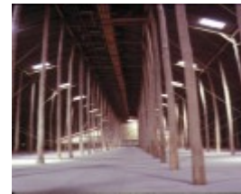
murtoa grain store wimmera hwy murtoa interior from ground view