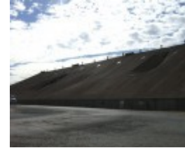
MARMALAKE/MURTOA GRAIN STORE SOHE 2008