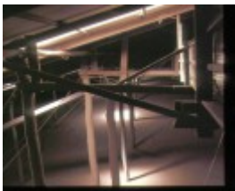
murtoa grain store wimmera hwy murtoa interior rafters