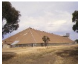
murtoa grain store wimmera hwy murtoa site view