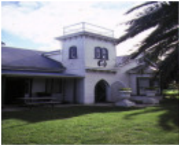
woolamai house cleeland road woolamai waters phillip island tower view jun1987