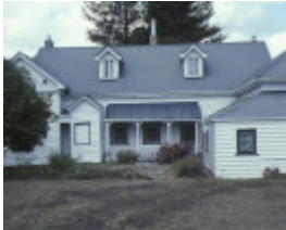
woolamai house cleeland road woolamai waters phillip island rear view