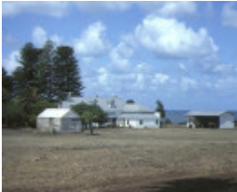
1 woolamai house cleeland road woolamai waters phillip island property view