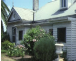
woolamai house cleeland road woolamai waters phillip island front view