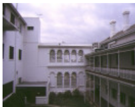
mount royal geriatric hospital poplar road parkville wing jul1998