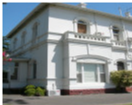
NORTH WEST HOSPITAL, PARKVILLE CAMPUS SOHE 2008