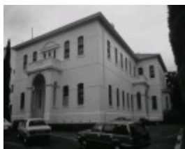
mount royal geriatric hospital poplar road parkville b&w entry extension