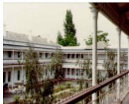
1 mount royal geriatric hospital poplar road parkville courtyard jul1998