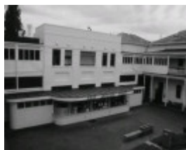
mount royal geriatric hospital poplar road parkville b&w kiosk