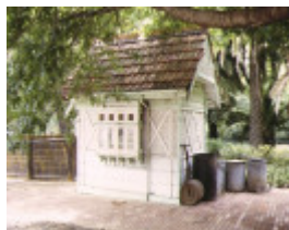
mount royal geriatric hospital poplar road parkville gate house jan1998