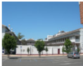
NORTH WEST HOSPITAL, PARKVILLE CAMPUS SOHE 2008