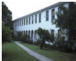
mount royal geriatric hospital poplar road parkville women's division dec1985