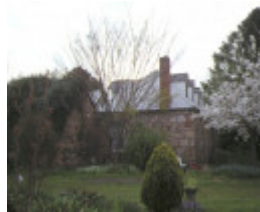
former travellers rest inn batesford side view oct1985