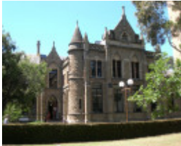
BALDWIN SPENCER BUILDING (OLD ZOOLOGY) SOHE 2008