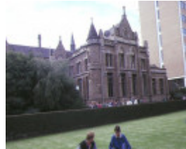
1 baldwin spencer building university of melbourne parkville front view