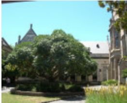
OLD PHYSICS CONFERENCE ROOM AND GALLERY SOHE 2008