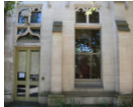
OLD PHYSICS CONFERENCE ROOM AND GALLERY SOHE 2008