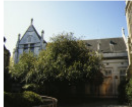
1 school of natural philosophy university of melbourne parkville front view