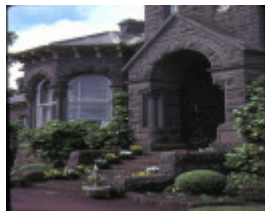
1 kolor homestead penshurst warrnambool road penshurst entrance nov1980