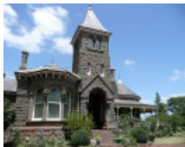
KOLOR HOMESTEAD SOHE 2008