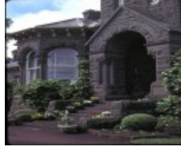
1 kolor homestead penshurst warrnambool road penshurst entrance nov1980