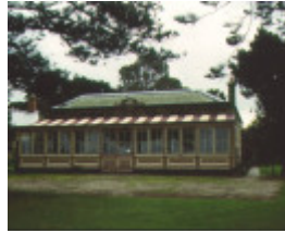
1point cooke homestead front facade july01