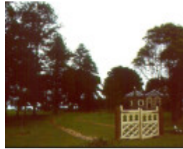
Point Cook Homestead Gates Side Facade July 01