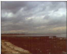
Point Cook Homestead Jetty July 01