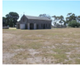
POINT COOK HOMESTEAD AND STABLES SOHE 2008