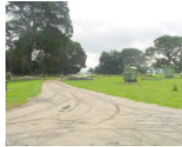
Point Cook Homestead Entrance