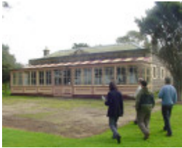
Point Cook Homestead Front Facade