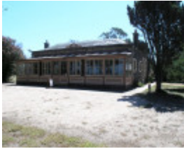
POINT COOK HOMESTEAD AND STABLES SOHE 2008