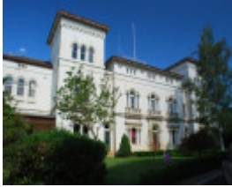
MAYDAY HILLS HOSPITAL SOHE 2008