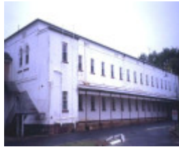
h01189 mayday hills hospital albert rd beechworth male wing