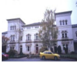
h01189 1 mayday hills hospital albert rd beechworth administration building