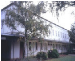
h01189 mayday hills hospital albert rd beechworth female wing