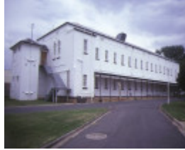
mayday hills hospital albert street beechworth rear view dec1984