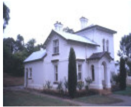
h01189 mayday hills hospital albert rd beechworth gatehouse