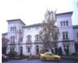
h01189 1 mayday hills hospital albert rd beechworth administration building