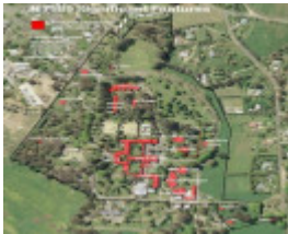
Mayday Hills building references