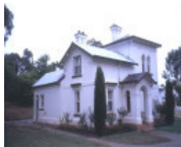
h01189 mayday hills hospital albert rd beechworth gatehouse