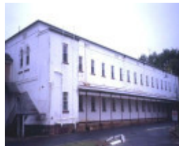
h01189 mayday hills hospital albert rd beechworth male wing