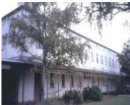
h01189 mayday hills hospital albert rd beechworth female wing