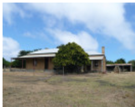
GLENAMPLE HOMESTEAD SOHE 2008