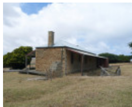
GLENAMPLE HOMESTEAD SOHE 2008