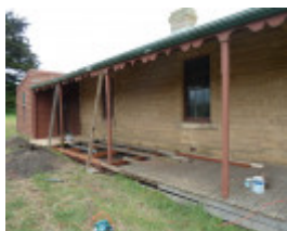
H0392 GLENAMPLE HOMESTEAD LHA 2015 2.JPG