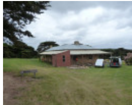
H0392 GLENAMPLE HOMESTEAD LHA 2015 1.JPG