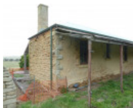
H0392 GLENAMPLE HOMESTEAD LHA 2015 4.JPG