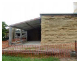
H0392 GLENAMPLE HOMESTEAD LHA 2015 3.JPG