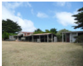
GLENAMPLE HOMESTEAD SOHE 2008