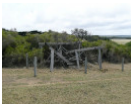
GLENAMPLE HOMESTEAD SOHE 2008