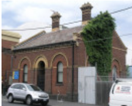
FORMER GAS INSPECTOR'S RESIDENCE SOHE 2008