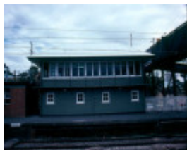
Ringwood Railway Station Railway Signal Box