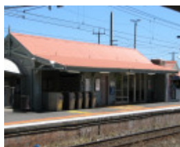
RINGWOOD RAILWAY STATION SOHE 2008