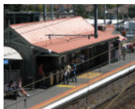
RINGWOOD RAILWAY STATION SOHE 2008