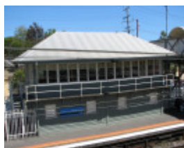
RINGWOOD RAILWAY STATION SOHE 2008