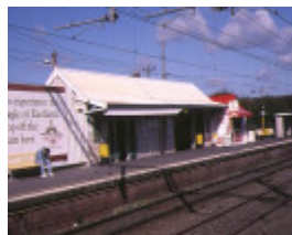
1 ringwood railway station railway place ringwood front view sep1995