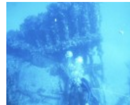
S108 Casino ApolloBay WreckDetail 15/06/1999