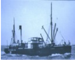
S108 Casino ApolloBay HistoricView dateunknown