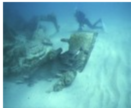
S108 Casino ApolloBay Sidedetail 15/06/1999