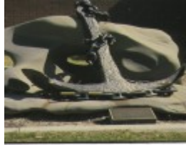
S108 Casino ApolloBay AnchorOnsurface dateunknown