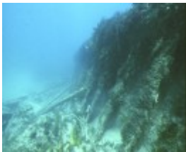
S108 Casino ApolloBay Hull 15/06/1999