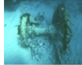
S108 Casino ApolloBay Artifact 15/06/1999