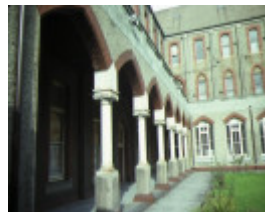
former convent of the good shepherd clarke street abbot'sford front view jun1984