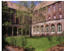
former convent of the good shepherd courtyard jun1992