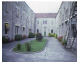
former convent of the good shepherd clarke street abbot'sford rear view