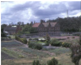
1 former convent of the good shepherd clarke street abbot'sford view of property nov1981 etc.