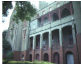
former convent of the good shepherd clarke street abbot'sford arcaded walkway jun1984 etc