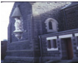
former convent of the good shepherd clarke street abbot'sford detail of statue nov1986