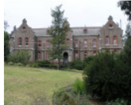
FORMER CONVENT OF THE GOOD SHEPHERD SOHE 2008