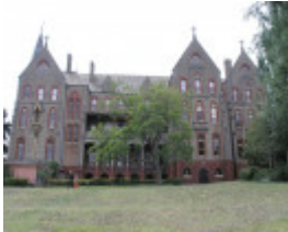
FORMER CONVENT OF THE GOOD SHEPHERD SOHE 2008