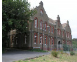
FORMER CONVENT OF THE GOOD SHEPHERD SOHE 2008