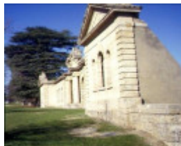
h00358 old hospital ruins church st beechworth view accross facade she project 2003