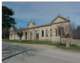
1 old hospital ruins church street beechworth