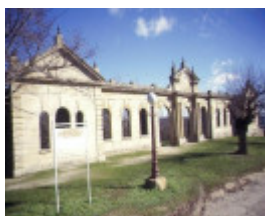
h00358 old hospital ruins church st beechworth view facade she project 2003