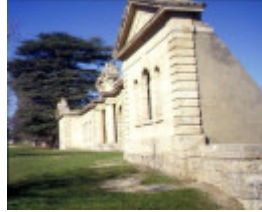
h00358 old hospital ruins church st beechworth view across facade she project 2003