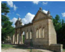
OLD HOSPITAL RUINS SOHE 2008