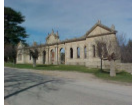
1 old hospital ruins church street beechworth