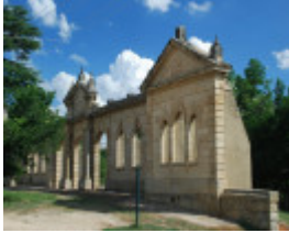
OLD HOSPITAL RUINS SOHE 2008