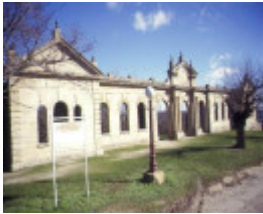
h00358 old hospital ruins church st beechworth view facade she project 2003