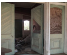
H1590 FORMER RUPANYUP RAILWAY STATION LHA 2015 8.JPG