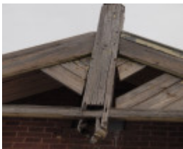
H1590 FORMER RUPANYUP RAILWAY STATION LHA 2015 5.JPG