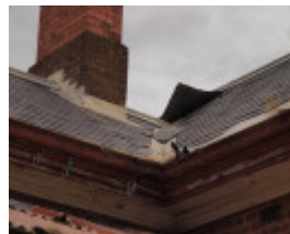
H1590 FORMER RUPANYUP RAILWAY STATION LHA 2015 6.JPG