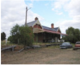
FORMER RUPANYUP RAILWAY STATION SOHE 2008