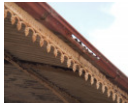
H1590 FORMER RUPANYUP RAILWAY STATION LHA 2015 3.JPG