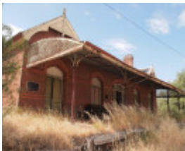
H1590 FORMER RUPANYUP RAILWAY STATION LHA 2015 2.JPG