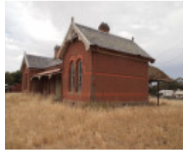
H1590 FORMER RUPANYUP RAILWAY STATION LHA 2015 1.JPG