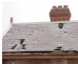
H1590 FORMER RUPANYUP RAILWAY STATION LHA 2015 4.JPG