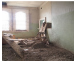
H1590 FORMER RUPANYUP RAILWAY STATION LHA 2015 7.JPG