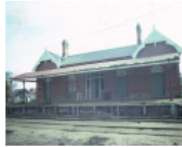
1 rupanyup railway station cromie street rupanyup trackside view jul1984