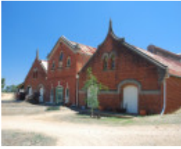
MOUNT OPHIR WINERY SOHE 2008