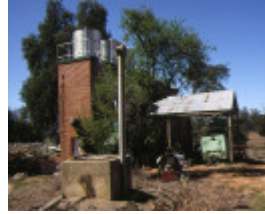
mount ophir winery stillards lane rutherglen storage tanks sep1994