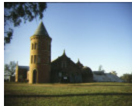
1 mount ophir winery stillards lane rutherglen view of winery jun1981