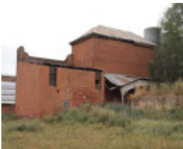
H0334 MOUNT OPHIR WINERY LHA 2015 4.JPG