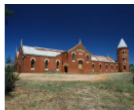
MOUNT OPHIR WINERY SOHE 2008