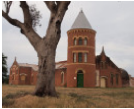
H0334 MOUNT OPHIR WINERY LHA 2015 1.JPG