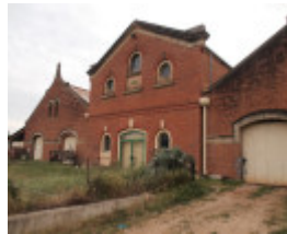
H0334 MOUNT OPHIR WINERY LHA 2015 3.JPG