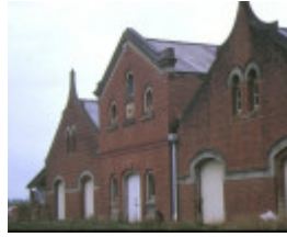
mount ophir winery stillards lane rutherglen front view aug1992