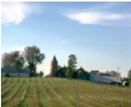
h00334 mt ophir winery apr1996