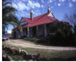
mount ophir winery stillards lane rutherglen homestead oct1981