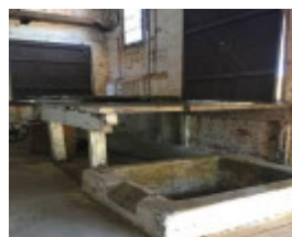
2019 winery interior.jpg