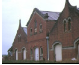
mount ophir winery stillards lane rutherglen front view aug1992