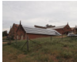
H0334 MOUNT OPHIR WINERY LHA 2015 2.JPG