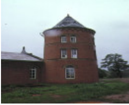
mount ophir winery stillards lane rutherglen view of tower sep1992