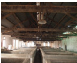
H0334 MOUNT OPHIR WINERY LHA 2015 6.JPG