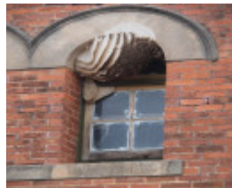
H0334 MOUNT OPHIR WINERY LHA 2015 5.JPG