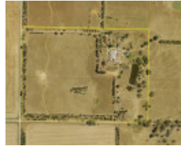
Aerial, extent of registration.jpg