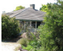
STOKESAY SOHE 2008