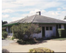
1 stokesay seaford front view