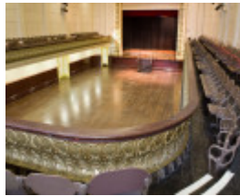
Collingwood Town Hall - Ballroom .JPG