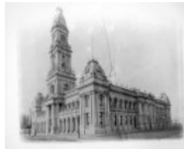
Collingwood Town Hall Exterior 1887.jpg