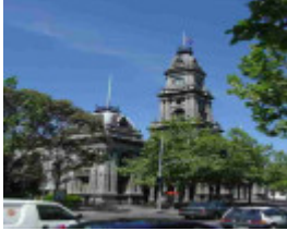
hoddle street 140