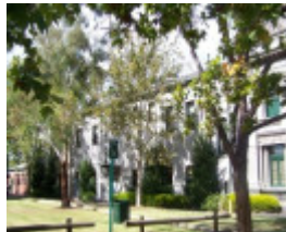
View from park to the north of the Town Hall