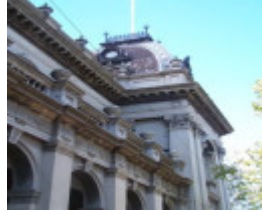
Hoddle St 140 9355.JPG