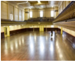
Collingwood Town Hall - Ballroom.JPG