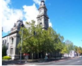
Hoddle St 140 9351.JPG