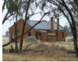
THE WOOLSHED SOHE 2008