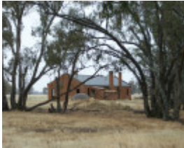
THE WOOLSHED SOHE 2008