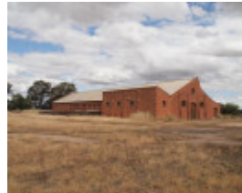
H0480 THE WOOLSHED LHA 2015 1.JPG