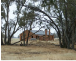
THE WOOLSHED SOHE 2008