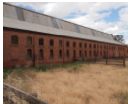
H0480 THE WOOLSHED LHA 2015 2.JPG