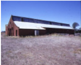
1 the woolshed east loddon serpentine side view mar1987