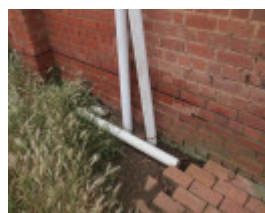
H0480 THE WOOLSHED LHA 2015 7.JPG