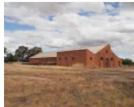
H0480 THE WOOLSHED LHA 2015 1.JPG