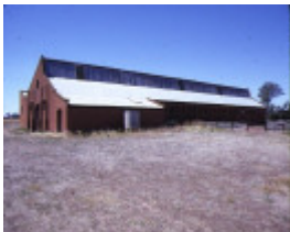
1 the woolshed east loddon serpentine side view mar1987