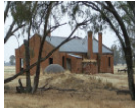
THE WOOLSHED SOHE 2008