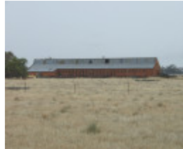
THE WOOLSHED SOHE 2008