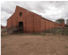
H0480 THE WOOLSHED LHA 2015 3.JPG