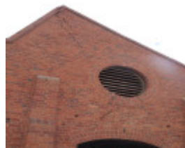
H0480 THE WOOLSHED LHA 2015 4.JPG