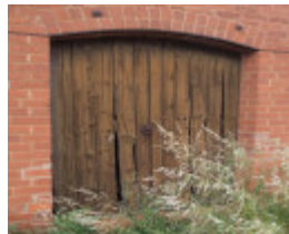
H0480 THE WOOLSHED LHA 2015 5.JPG