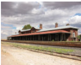
Serviceton RWS Railway Side February 2002