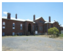
SERVICETON RAILWAY STATION SOHE 2008