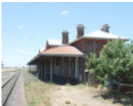
SERVICETON RAILWAY STATION SOHE 2008