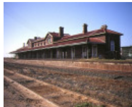
1 serviceton railway station elizabeth street serviceton trackside view apr1995