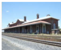
SERVICETON RAILWAY STATION SOHE 2008