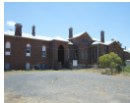
SERVICETON RAILWAY STATION SOHE 2008