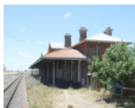
SERVICETON RAILWAY STATION SOHE 2008