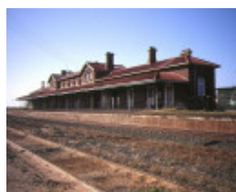
1 serviceton railway station elizabeth street sreviceton trackside view apr1995