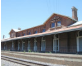
SERVICETON RAILWAY STATION SOHE 2008