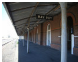
SERVICETON RAILWAY STATION SOHE 2008