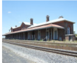
SERVICETON RAILWAY STATION SOHE 2008