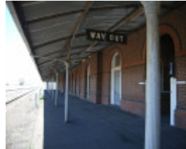
SERVICETON RAILWAY STATION SOHE 2008