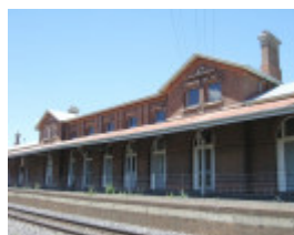
SERVICETON RAILWAY STATION SOHE 2008