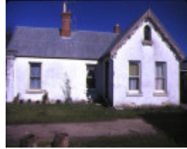
1 39 finch street beechworth front view sep1983