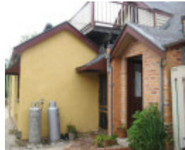
Rear, 1867 kitchen on left