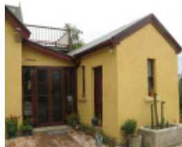
kitchen and bathroom right