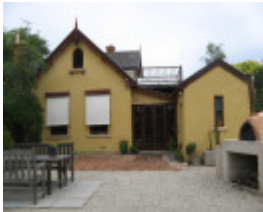
view from north, kitchen on right, infilled breezeway between it and house