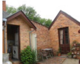
Back entrance and 1862 kitchen