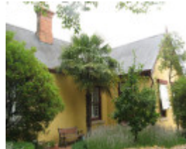
Entrance in corner