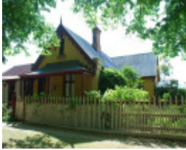
BUILDING SOHE 2008