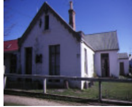
39 finch street beechworth side view sep1983