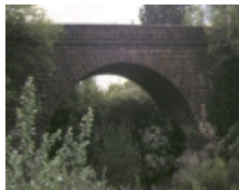
1 bridge over bullarook creek smeaton side view