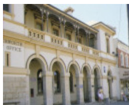
beechworth post office ford street beechworth colonaded verandah