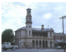
1 beechworth post office ford street beechworth front view dec1990