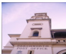
beechworth post office ford street beechworth tower elevation mar1998