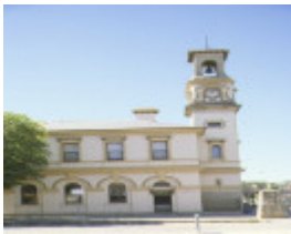
beechworth post office ford street beechworth front elevation