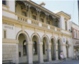
beechworth post office ford street beechworth colonaded verandah