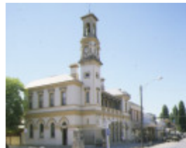
beechworth post office ford street beechworth side view