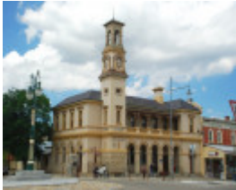
BEECHWORTH POST OFFICE SOHE 2008