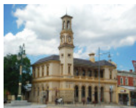
BEECHWORTH POST OFFICE SOHE 2008