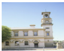
beechworth post office ford street beechworth front elevation