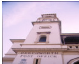
beechworth post office ford street beechworth tower elevation mar1998