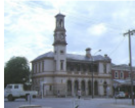
1 beechworth post office ford street beechworth front view dec1990