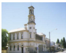
beechworth post office ford street beechworth side view