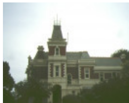
1 coolart lord somers road somers front view jan1994