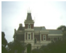
1 coolart lord somers road somers front view jan1994