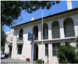
SOUTH MELBOURNE COURT HOUSE AND POLICE STATION SOHE 2008