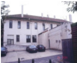
h01486 south melbourne court house and police station rear she project 2004