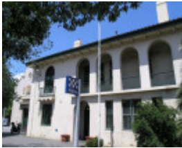
SOUTH MELBOURNE COURT HOUSE AND POLICE STATION SOHE 2008