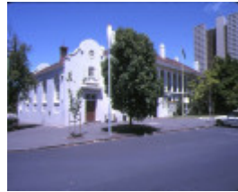
1 south melbourne court house & police station bank street south melbourne front view