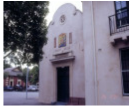
h01486 south melbourne court house and police station entry she project 2004